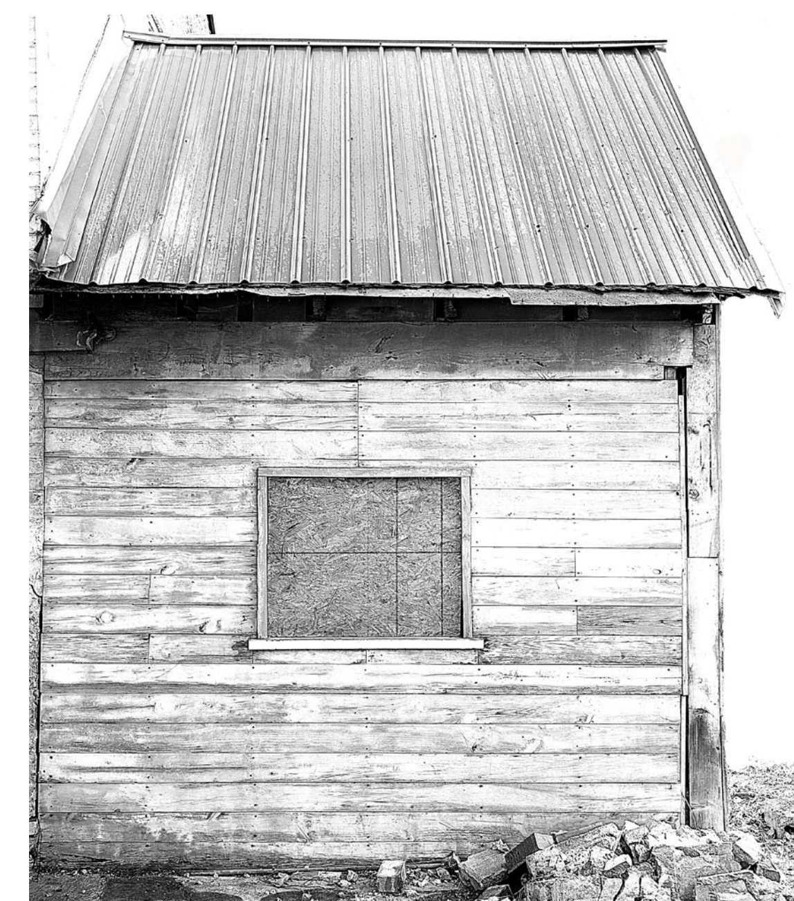
South Facade - Main

Notice: PhotoDrawing™ blueprints on these pages are produced under one or more of the following U.S. Patents 8,194,074, 8,542,233, 8,866,814, and 9,715,755; and patents pending. http://manassasconsulting.com Do not remove this notice.