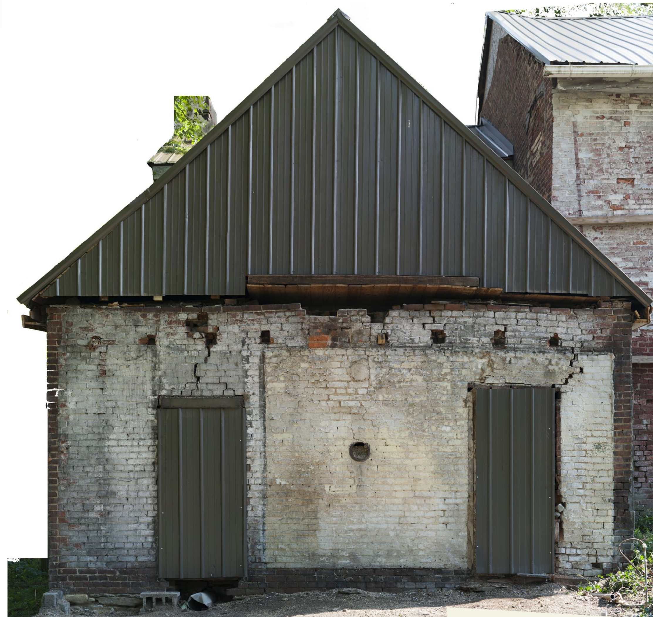
South Facade - left & Sidewalls above lower roof